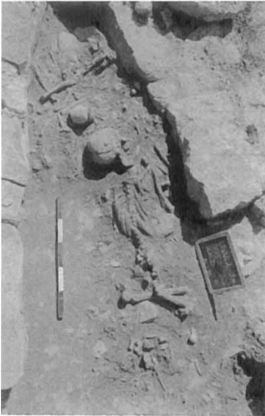
Fig. 4. Aerial view of Chamber D showing articulated human and dog skeleton as well as complete ceramic vessel and Terebralia palustris shell (Photo: S. Blau).

reptiles to hide, nest or hunt in the area of the site. The presence of bats, rodents, possibly a young fox and a small number of fish and turtle bones, in conjunction with the bones of birds such as terns, swifts and birds of prey, suggests that a variety of natural accumulating agents was involved in forming the assemblage of bones found within the disturbed layers of the tomb.